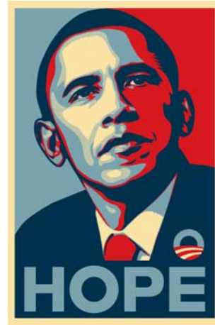
Obama Hope Poster

143. Upon information and belief, by misrepresenting the true source of the Infringing Works, Plaintiffs have engaged in a misguided effort to argue that Fairey made more substantial changes to the photograph — i.e., that he at least had to crop it — than he actually did. But a simple comparison of the Clooney Photo to the Infringing Works and the Obama Photo make clear to even the casual observer that Fairey used the Obama Photo, depicting President Obama sitting alone, as the basis for the Infringing Works. Moreover, it has been widely reported that third-party image recognition software has been used to determine that the Obama Photo was indeed the photo which Fairey used. Unlike the Clooney Photo, both the Obama Photo and the Infringing Works depict exactly the same close-up of President Obama, tightly framed with his head tilted at the same angle, with the same expression on his face and the same focus of his eyes, along with the same lighting and shading. Significantly, in both the Obama Photo and the Infringing Works, Mr. Clooney is nowhere to be seen.