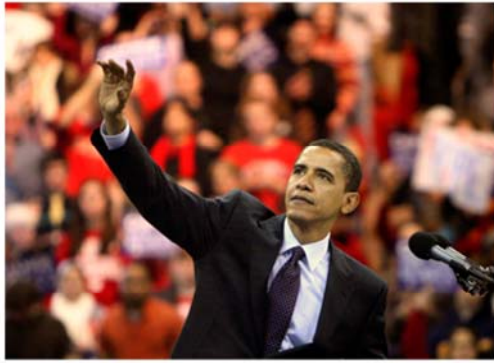
The AP Photo

For example, The AP licensed rights to a photograph of President Obama from its digital photo archive for use on a tote bag.