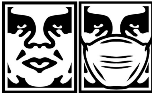
Fairey’s Protect Orr’s Protect Yourself

work that borrows from Fairey’s Obey® image. Orr’s work, titled Protect Yourself (bottom right), covered the face of Fairey’s Protect (bottom left) with a surgeon’s mask.