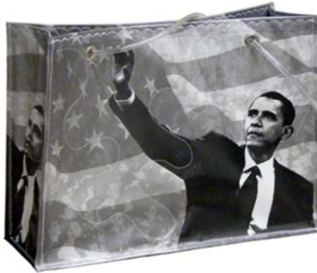
Licensed Derivative Work

93. The AP is not unique in licensing images for use in advertising, artistic works and merchandise, including on tote bags, T-shirts, posters, prints, banners and the like. The talent, skill and effort required to create compelling still images has fostered a vibrant market for professional photography, one on which many photographers have come to rely for their livelihoods. In addition, many content providers, whether news or entertainment in nature, rely on this revenue to support their activities. The AP's licensing program not only allows it to continue operating its full scale, robust and dependable newsgathering services worldwide, but it enables The AP to pursue efforts protecting the First Amendment and guaranteeing public access to open government on the local, state and federal levels.