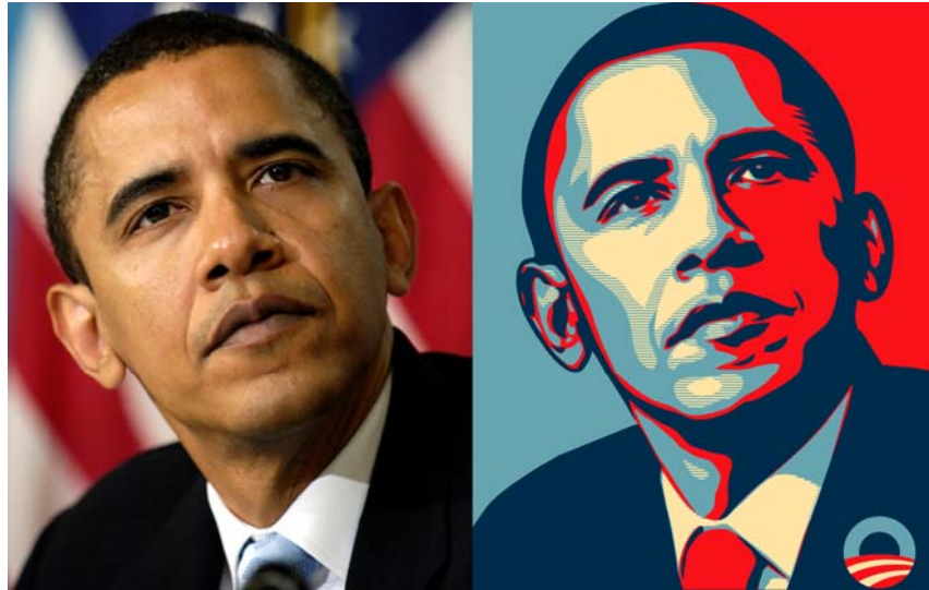
The AP's Obama Photo